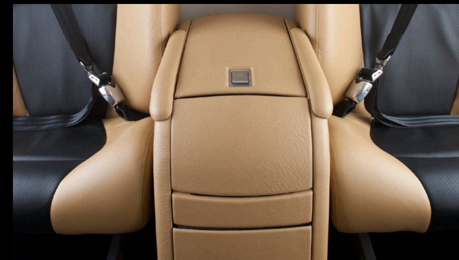
Well appointed seating with accessible furnishings