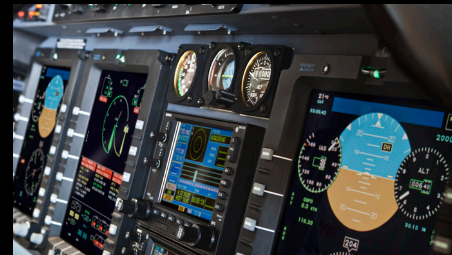
Epitome of advanced flight technology