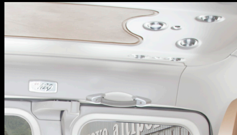
Headliners and sideliners convey modern sophistication