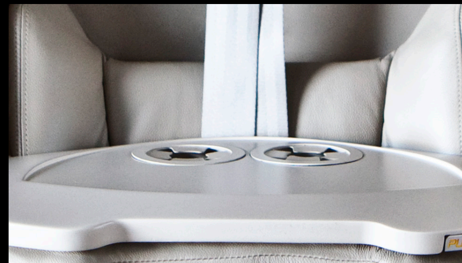
Personalized interiors and exteriors that express your style